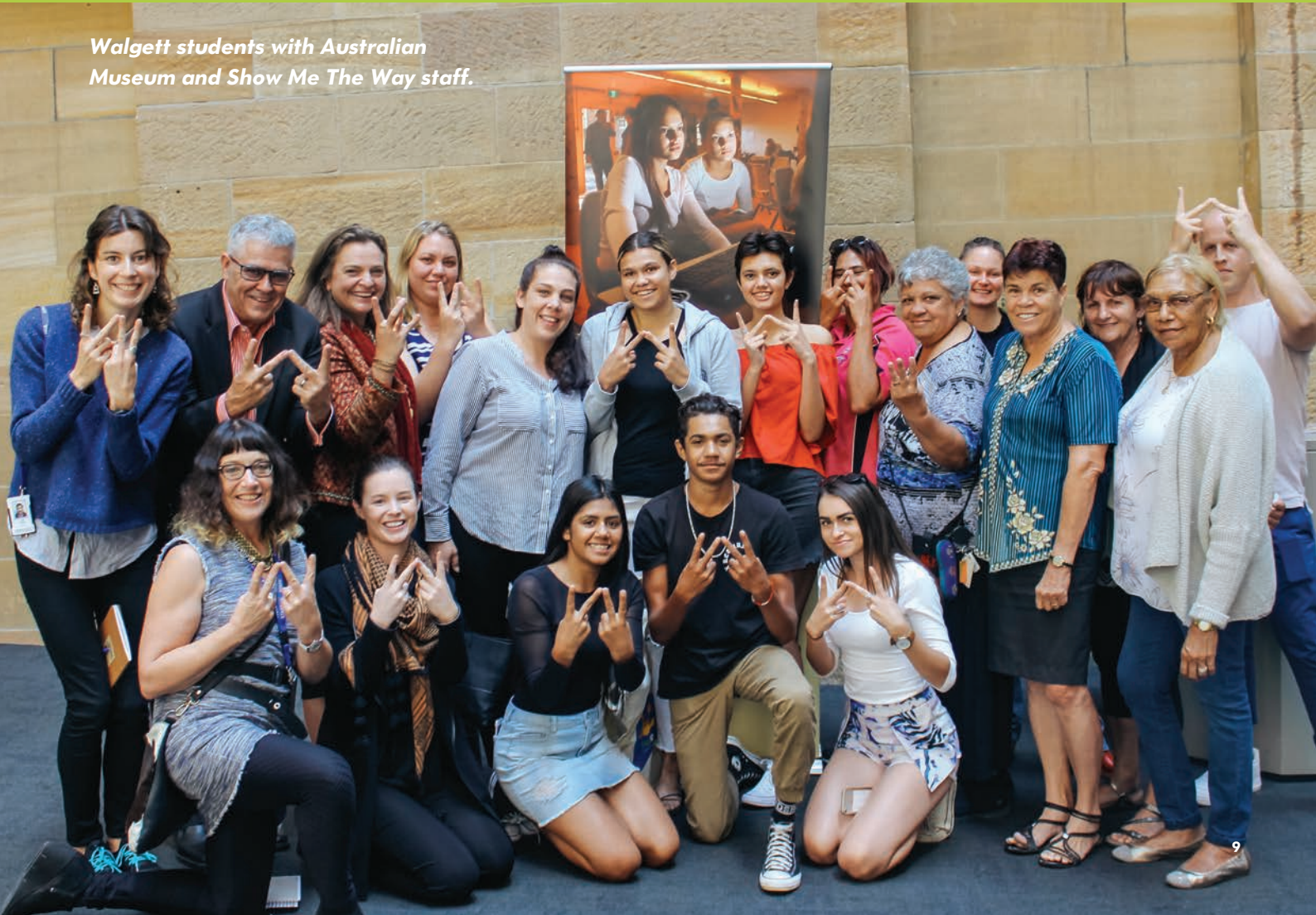
Walgett students with Australian Museum and Show Me The Way staff.

“It was probably the best thing I've ever done. It's the only thing I've ever done from start to finish and now I can look back and see the result and I feel proud.”